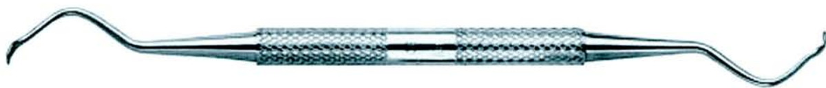
1 Sinus Lift Instrument 3.5mm