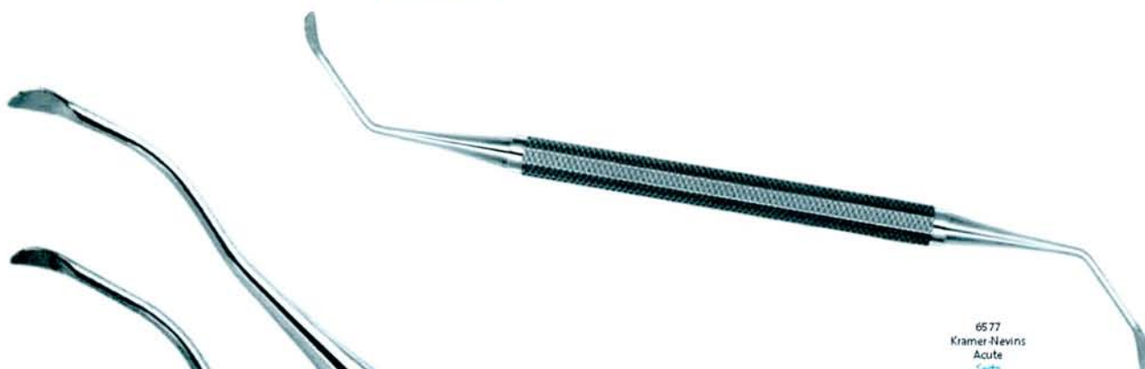
6577 Kramer-Nevis Acute Split